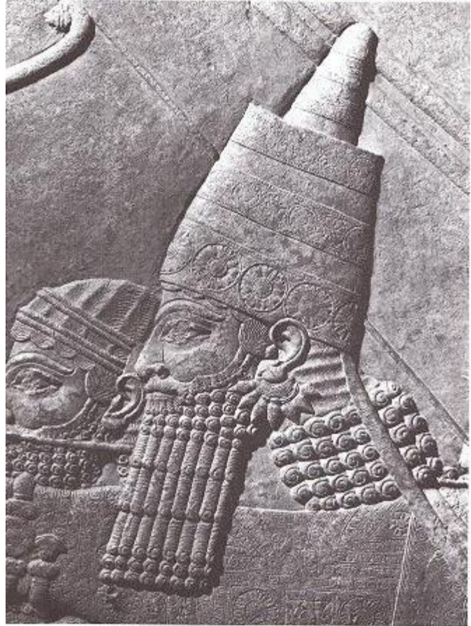
King Ashurbanipal, 669-627 B.C.. The excavations of his library provided a major source of Mesopotamian literature, including a good portion of the Epic of Gilgamesh.

So the trapper set out on his journey to Uruk and addressed himself to Gilgamesh saying, 'A man unlike any other is roaming now in the pastures; he is as strong as a star from heaven and I am afraid to approach him. He helps the wild