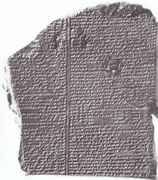
A fragment of a tablet showing the story of the flood, inscribed in Assyrian cuneiform characters.

-'Then was the launching full of difficulty; there was shifting of ballast above and below till two thirds was submerged. I loaded into her all that I had of gold and of living things, my family, my kin, the beast of the field both wild and tame, and all the craftsmen. I sent them on board, for the time that Shamash had ordained was already fulfilled when he said, "in the evening, when the rider of the storm sends down the destroying rain, enter the boat and batten her down." The time was fulfilled, the evening came, the rider of the storm sent down the rain. I looked out at the weather and it was terrible, so I too boarded the boat and battened her down. All was now complete, the battening and the caulking; so I handed the tiller to Puzur-Amurri the steersman, with the navigation and the care of the whole boat.