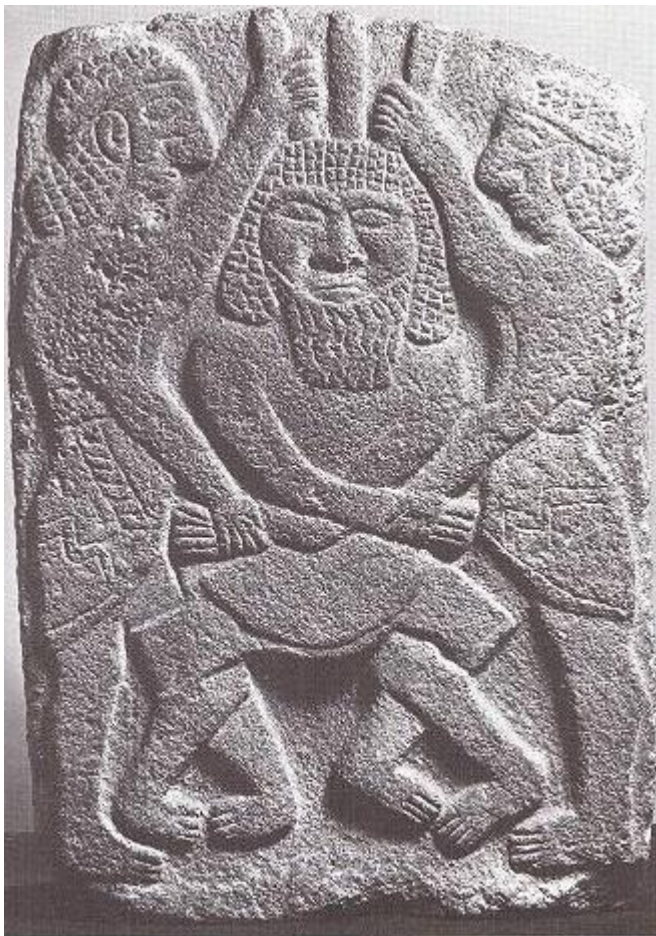
Gilgamesh and Enkidu's battle with Humbaba.

Gilgamesh replied: 'Where is the man who can clamber to heaven? Only the gods live for ever with glorious Shamash, but as for us men, our days are numbered, our occupations are a breath of wind. How is this, already you are afraid! I will go first although I am your lord, and you may safely call out, "Forward, there is nothing to fear!" Then if I fall I leave behind me a name that endures; men - will say of me, "Gilgamesh has fallen in fight with ferocious Humbaba." Long after the child has been bony in my house, they will say it, and remember.' Enkidu spoke again to Gilgamesh, 'O my lord, if you will enter that country, go first to the hero Shamash, tell the Sun God, for the land is his. The country where the cedar is cut belongs to Shamash.'